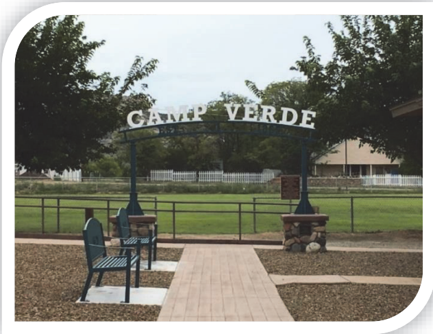
From Top To Bottom: Viewshed Off State Route 260; Community Park Off Main Street; Prescott National Forest Lands